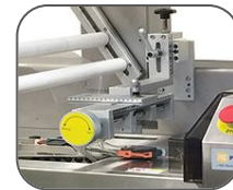
The standard film former manually adjusts to meet a range of package sizes