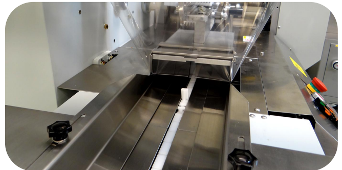
Delicate product conveyor with carrier card in-feed guide rails to handle product transitioning to the custom fixed former.

Carrier Card Guide Rails —Infeed guide rails to support carrier cards