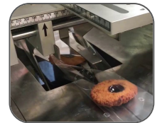
The Flow Wrapper 350T rapidly encloses the product in a tube of film before cutting and sealing the packages