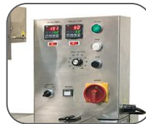
Simple to use controls adjust flow wrapping speed, sealing temperature, and more